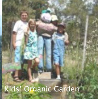
Kids' Organic Garden

Come forth into the light of things, let nature be your teacher. -William Wordsworth