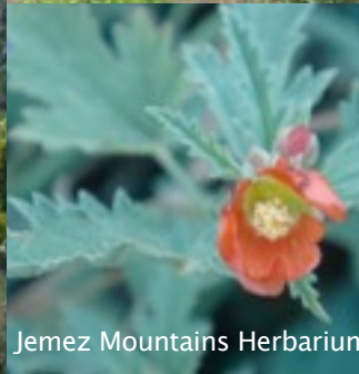
Jemez Mountains Herbarium