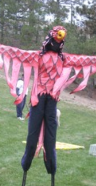
Earth Day Celebration